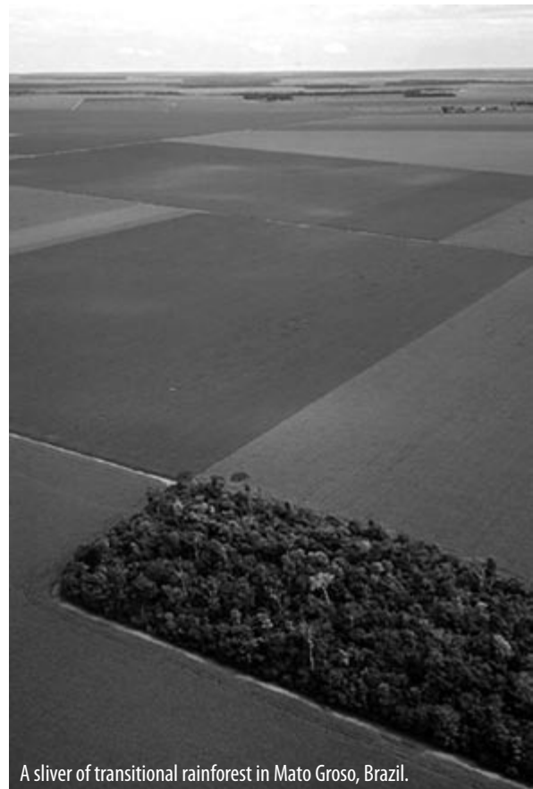
A sliver of transitional rainforest in Mato Grosso, Brazil.