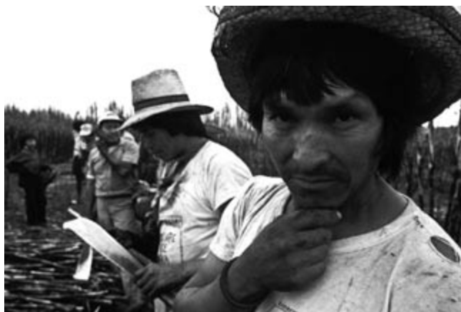
Indigenous cane cutters, São Paulo Brazil.