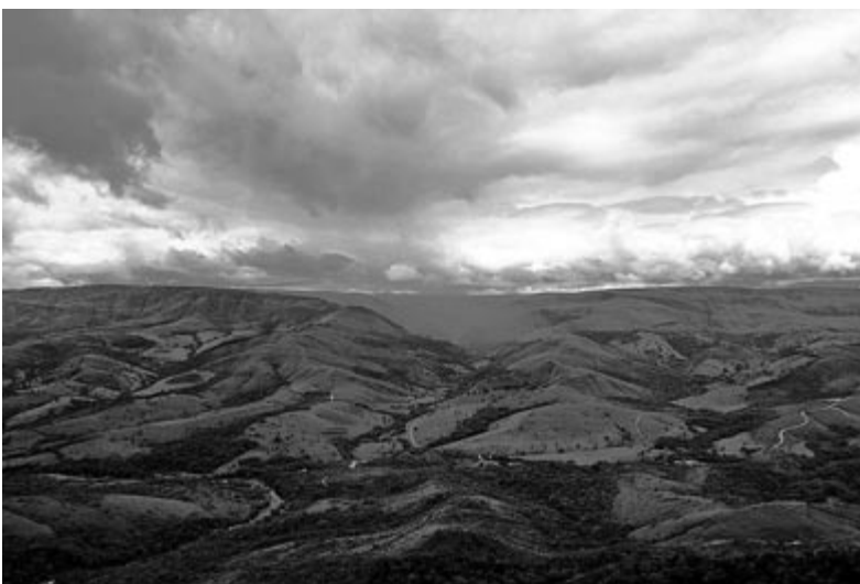
National park, Serra da Canastra, in Minas Gerais state